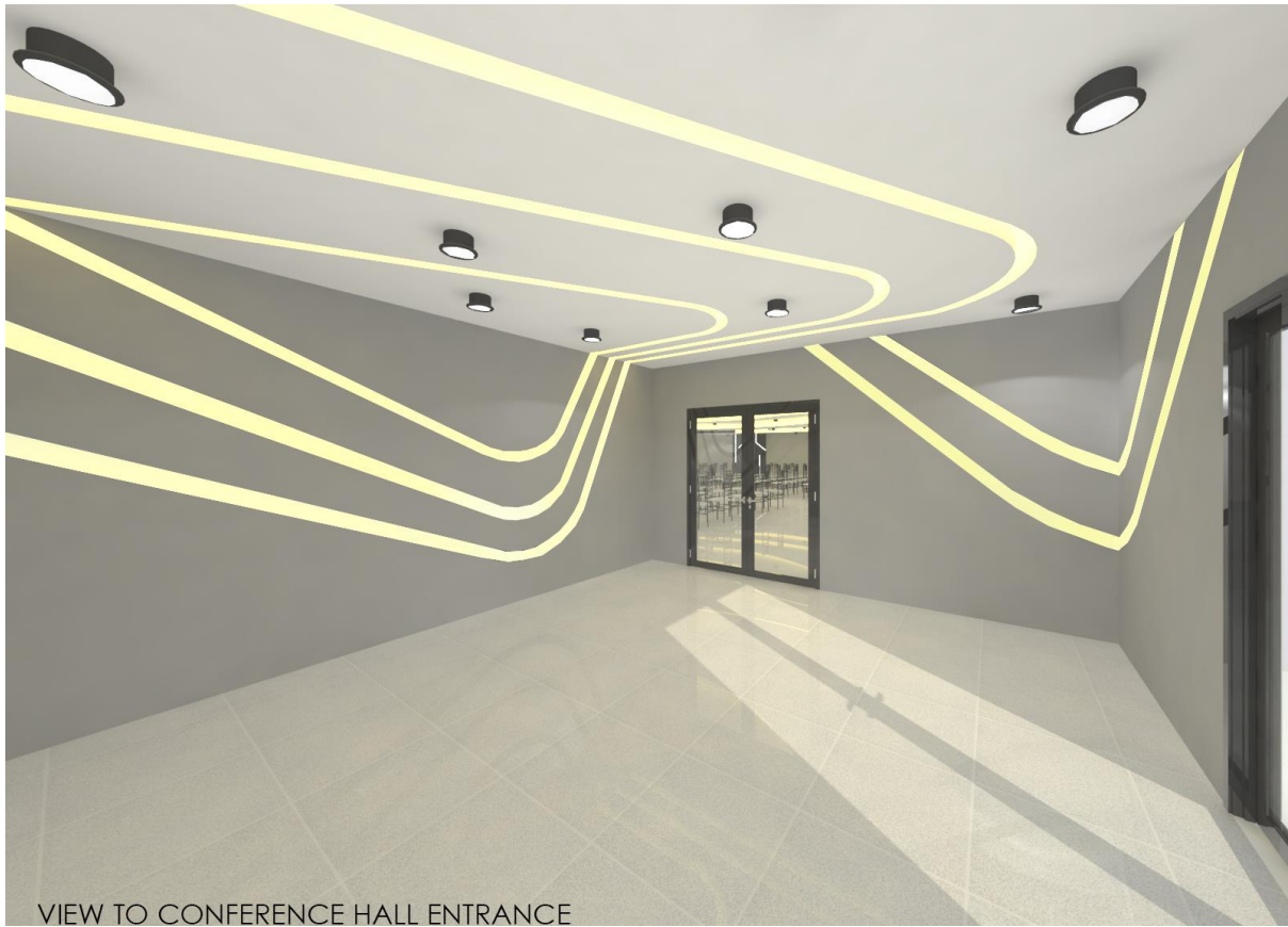
VIEW TO CONFERENCE HALL ENTRANCE