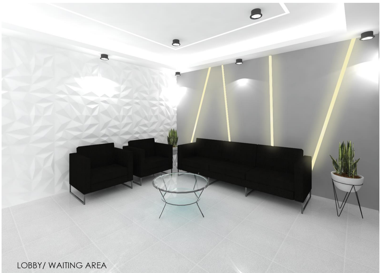
LOBBY/ WAITING AREA