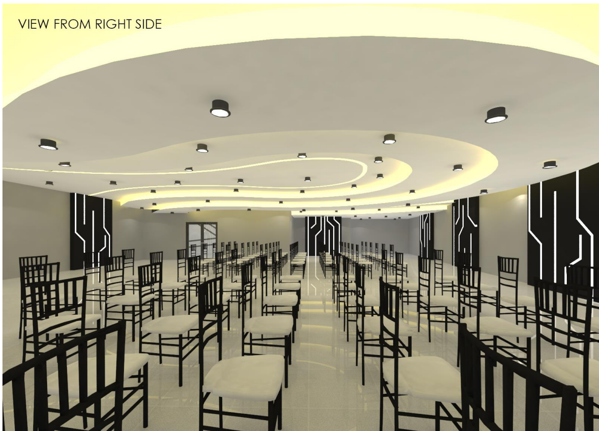
VIEW FROM RIGHT SIDE