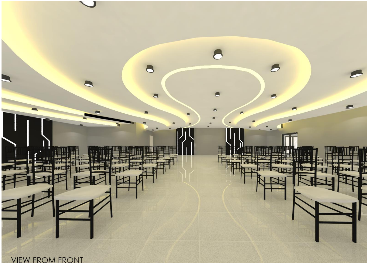
VIEW FROM FRONT